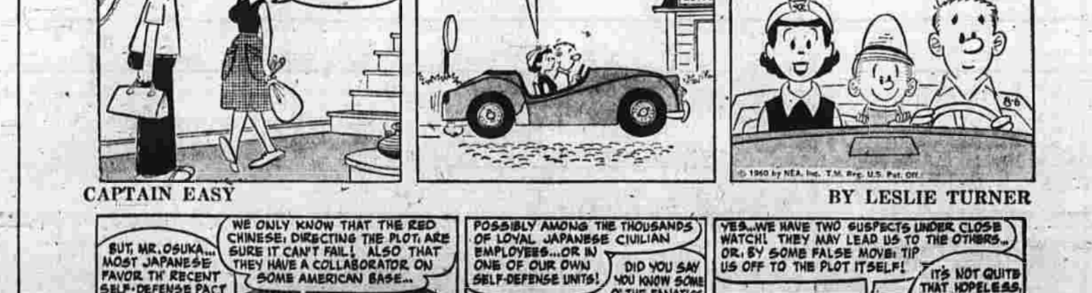
CAPTAIN EASY BY LESLIE TURNER