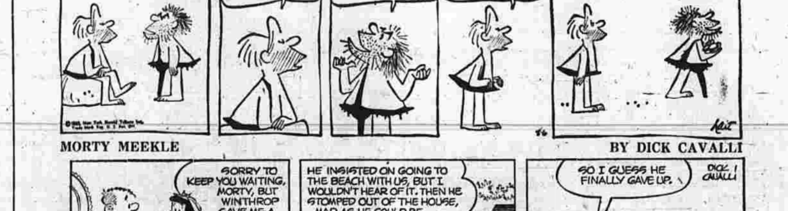
MORTY MEEPLE BY DICK CAVALLI