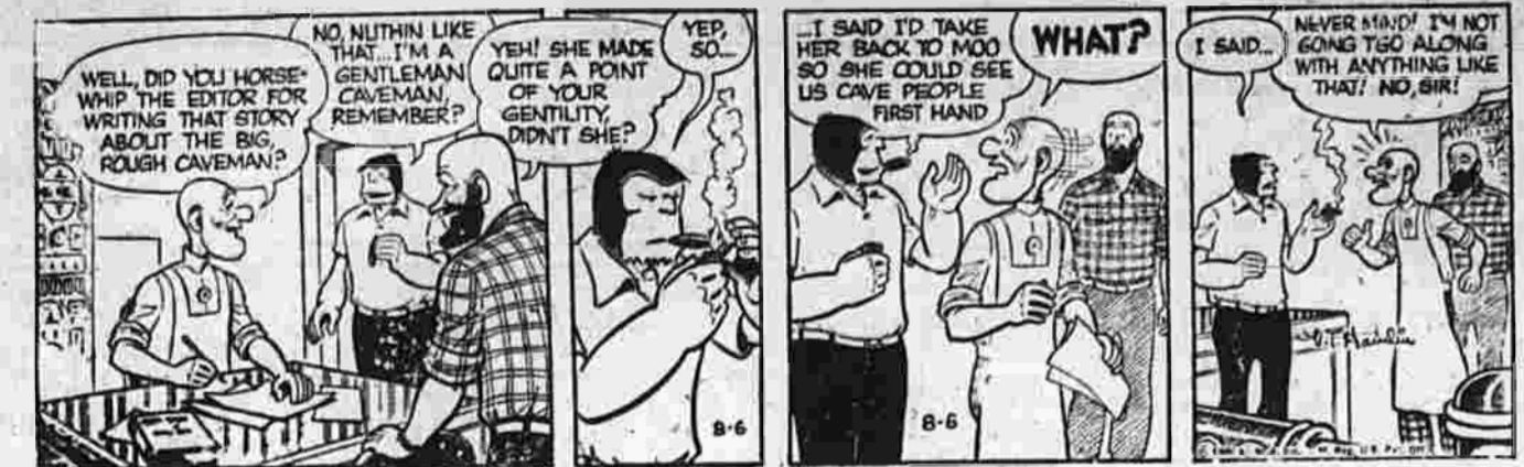
ALLY OOP BY V. T. HAMLIN