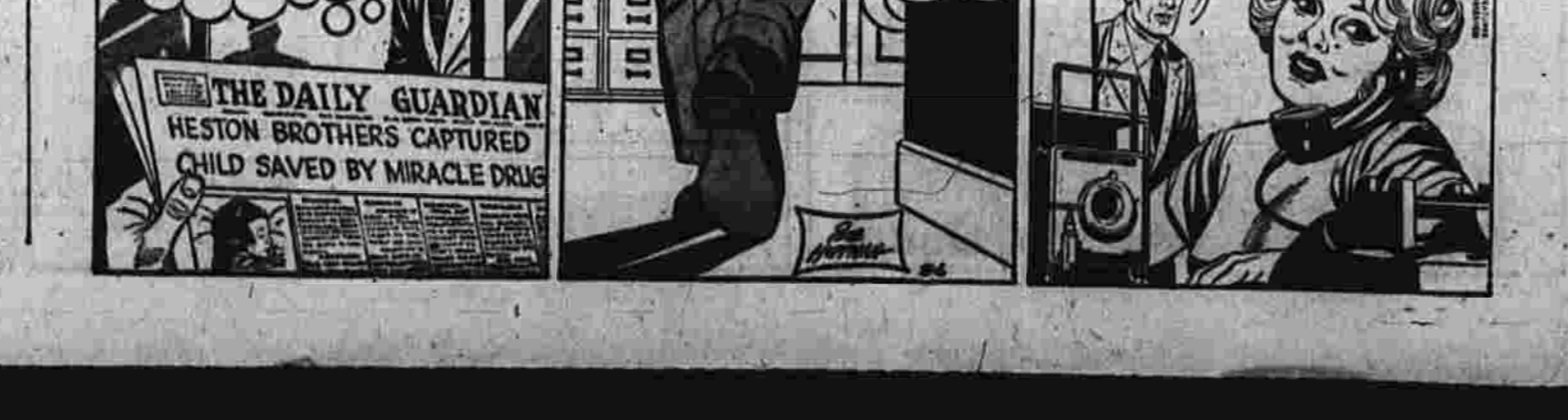
THE DAILY GUARDIAN