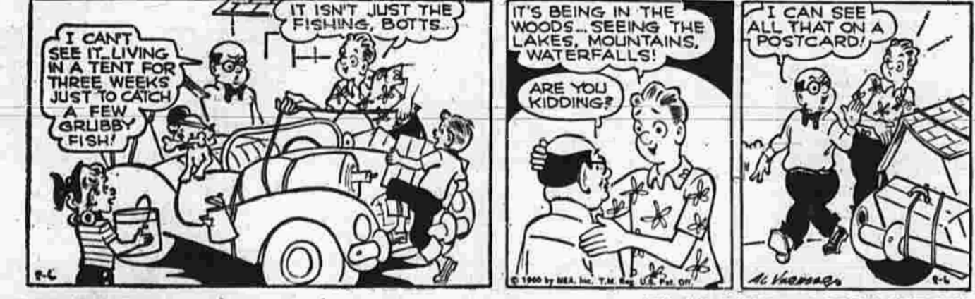
PRISCILLA'S POP BY AL VERMEER