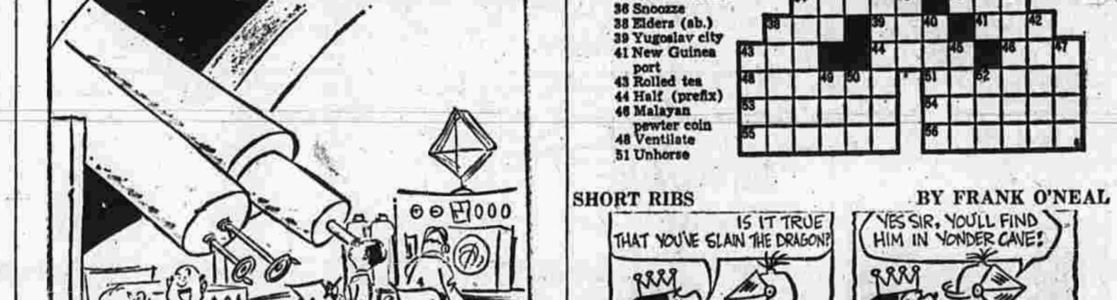
SHORT RIBS BY FRANK O'NEAL