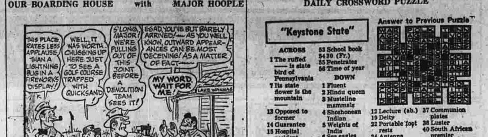
OUR BOARDING HOUSE with MAJOR HOOPLE