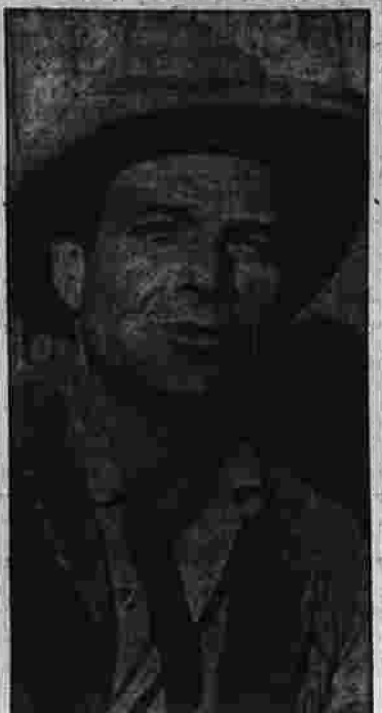
they neglected to check his riding ability.

He so well fitted the part, as the man had envisaged it, that