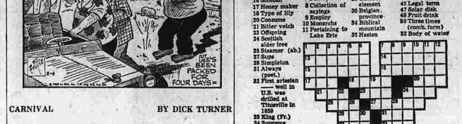
CARNIVAL BY DICK TURNER